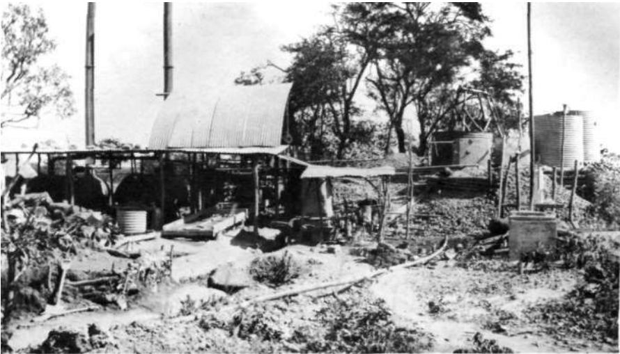
Piper Moss Mine, Que Que dsitric, 1914.