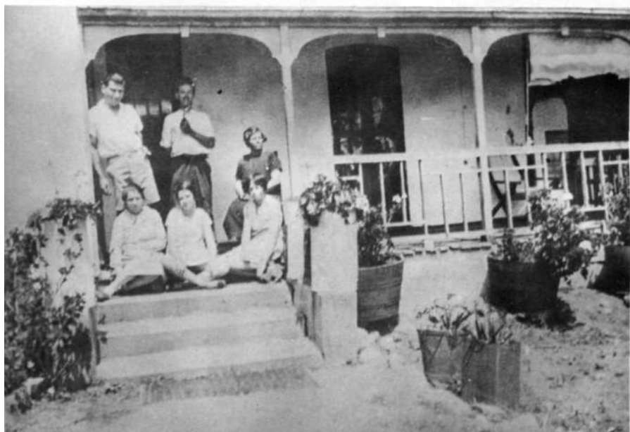
Front verandah of Barton Grange, 12 Oxford Road — Taken about 1932.