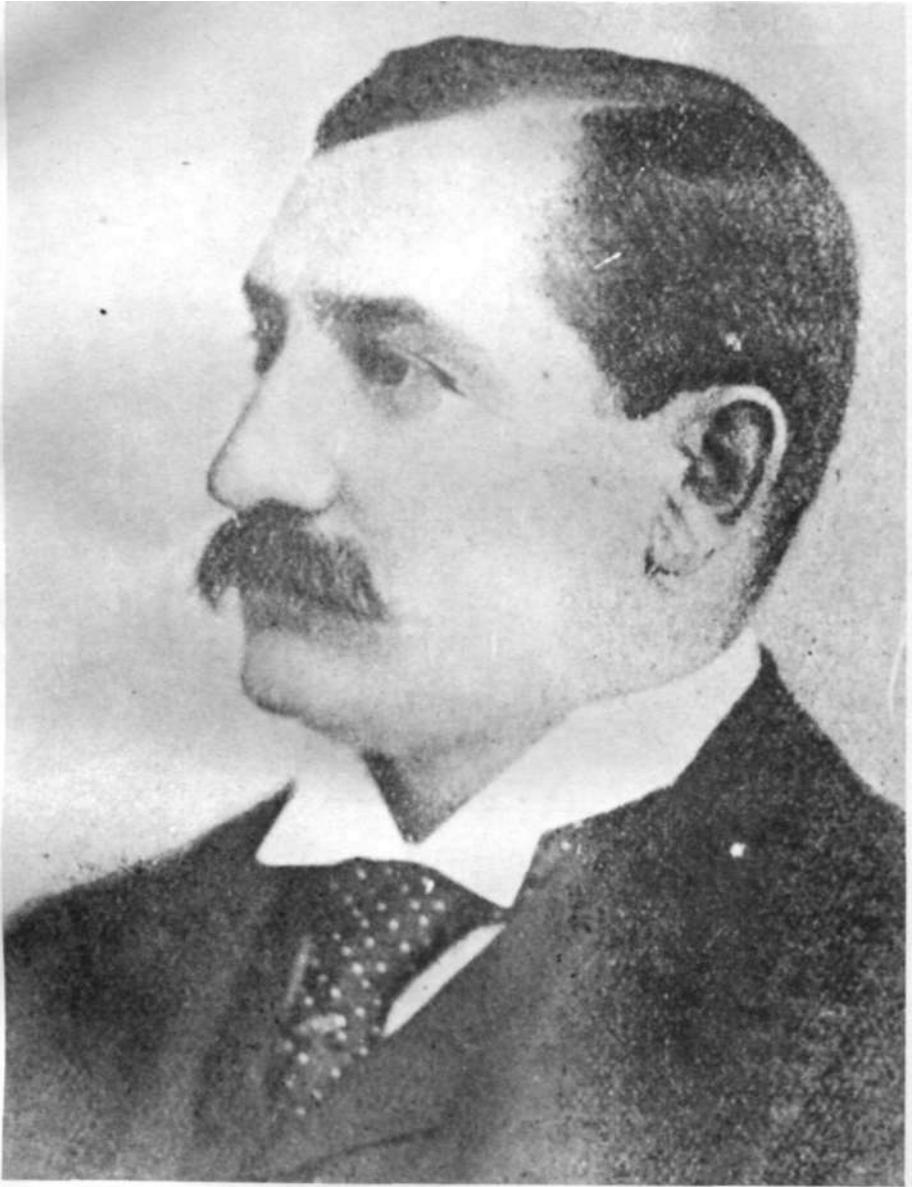
Judge Vincent (1902)