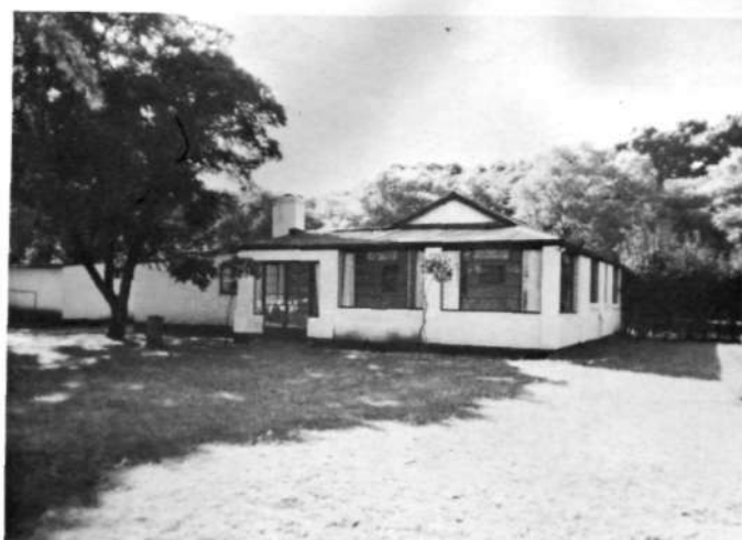
44, Heyman Road, Bulawayo.