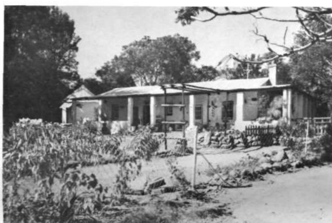
11, Kent Road. First Police Station at Hillside, Bulawayo.